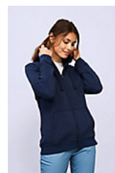
SOL'S SPIKE WOMEN 03106